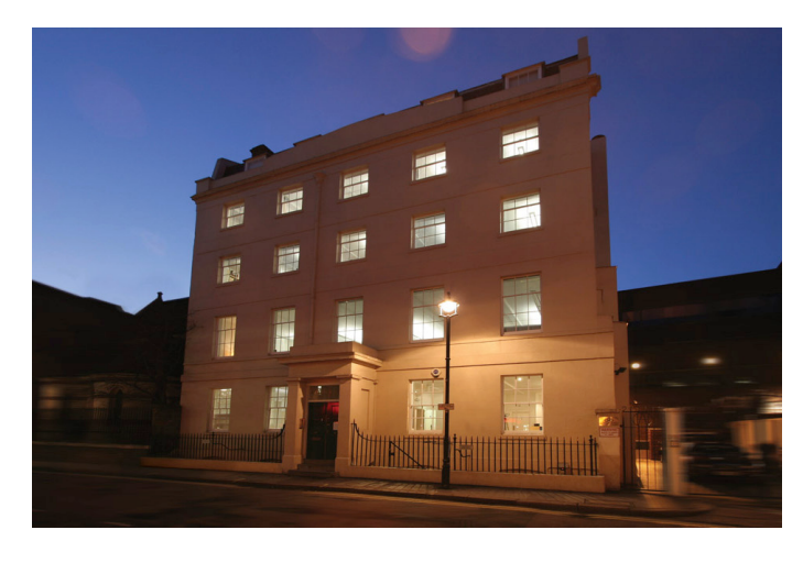
FilmLight's Soho headquarters

Headquartered in London's Soho, FilmLight is right at the centre of the UK's video and film post-production industry. That means we have a close relationship with the people who actually use our technology - although with 80% of sales made outside the UK, this is also a strongly international operation.