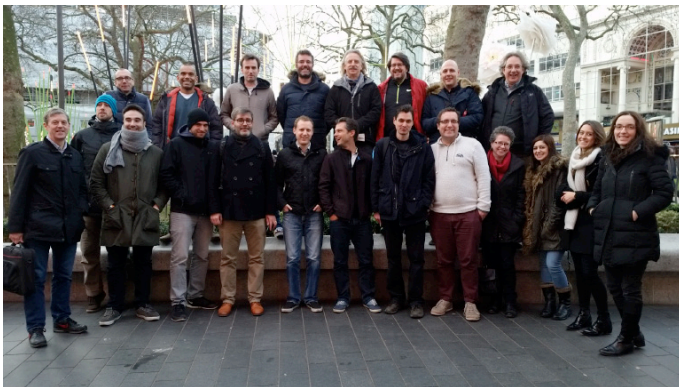
The FilmLight crew on the way to The Hateful Eight - Ultra Panavision 70mm Presentation

Specialising in colour manipulation, our systems are used on everything from A-list Hollywood blockbusters, like Black Panther, all the way through to art house movies, TV dramas, commercials, even natural history programmes. In fact, any moving image production where the quality of the final result and creative input are paramount.