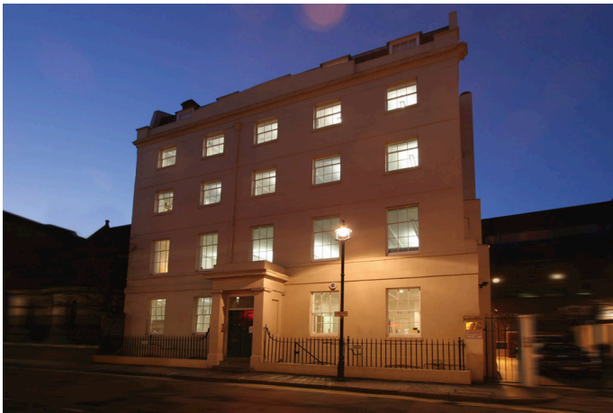
FilmLight's Soho headquarters

Headquartered in London's Soho, FilmLight is right at the centre of the UK's video and film post-production industry. That means we have a close relationship with the people who actually use our technology - although with 80% of sales made outside the UK, this is also a strongly international operation.