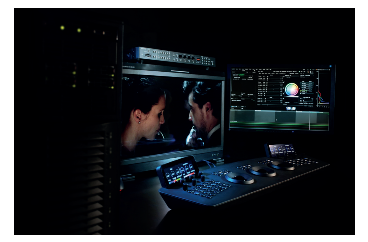
Baselight ONE with Slate

Created with today's multi-purpose post-production facility in mind, Slate is a high-quality, compact and affordable grading panel, with programmable adaptive keys and context-sensitive controls.