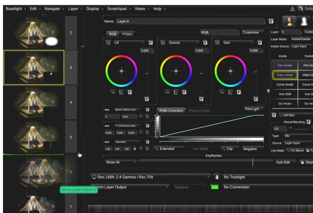
Layer view showing multiple layers and mattes

The beauty of rendering from Avid means that the Avid project is updated with links to the rendered shots automatically.