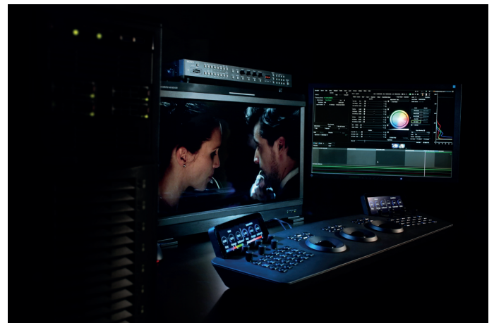
Baselight ONE with Slate

Created with today’s multi-purpose post-production facility in mind, Slate is a high-quality, compact and affordable grading panel, with programmable adaptive keys and context-sensitive controls.