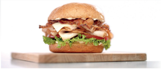
Arby's 'Both Bacon'