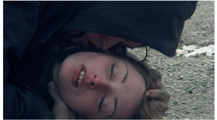
'Heaven Knows What'