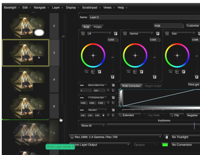
Layer view showing multiple layers and mattes

The beauty of rendering from Avid means the Avid project is updated with links to the rendered shots automatically.