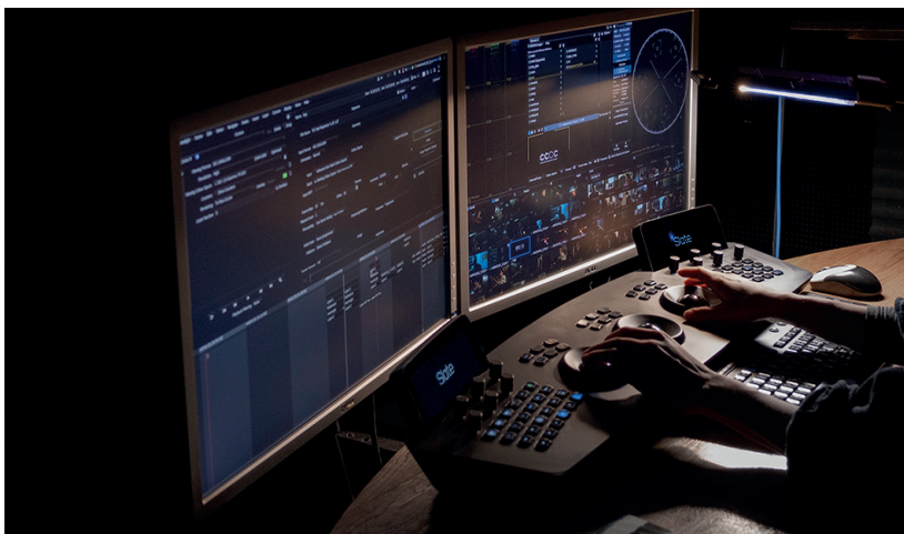
Slate control surface

Baselight S can utilise the portable and easily deployable Slate, while Baselight M supports both Slate and the full-size Blackboard Classic and Blackboard 2 panels. Support is also provided in both products for third-party control panels.